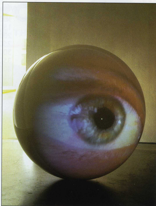
TONY OURSLER LISSON GALLERY

A 1.2m diameter sphere becomes a moving eye-ball when a video projector is played on it.