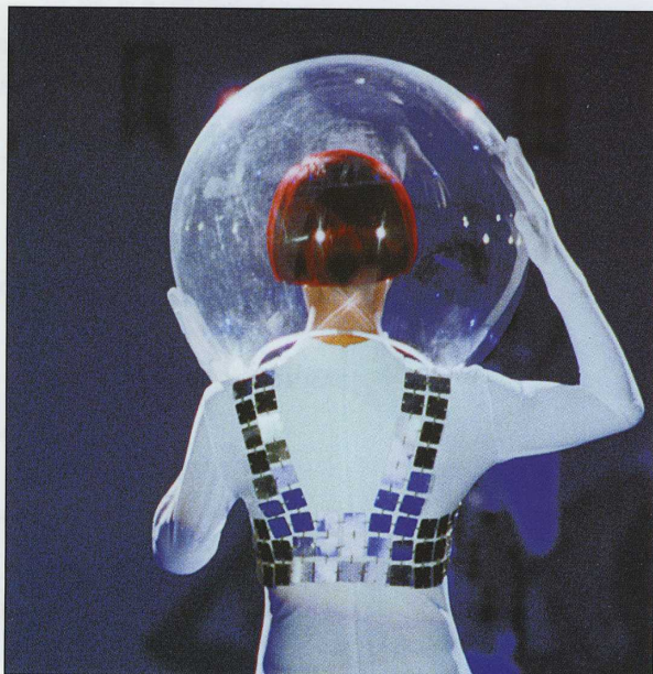
DISPLAY HELMET VIDAL SASSOON

Moulded globes with apertures, in one piece from 200mm diameter up to 600mm in clear and opal.