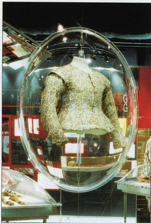
DISPLAY CASE MUSEUM OF LONDON

An effective way to house and highlight a product or exhibit in an oval shape (900mm x 600mm).